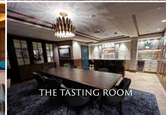
THE TASTING ROOM